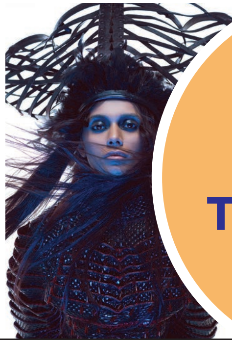
High end Fashion